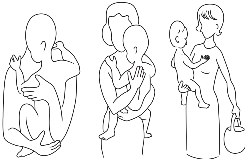
Fig. 2: Correct methods of carrying parietic child.