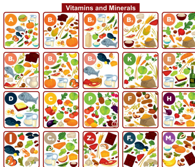
Fig. 3: Pictorial overview of food enriched with various vitamins and minerals.